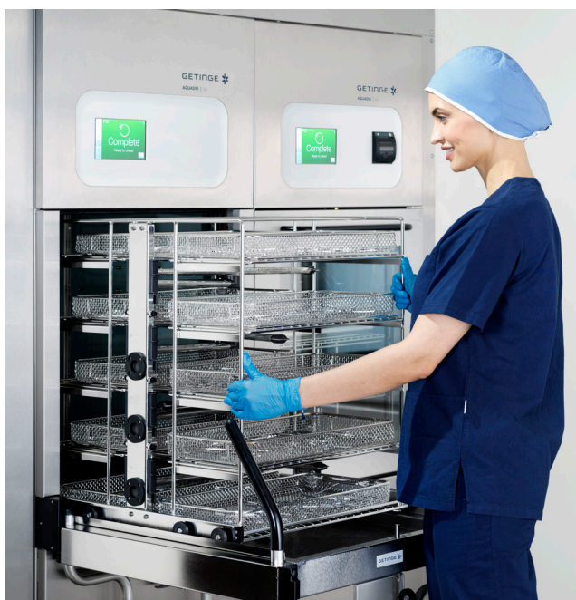
Loading/unloading trolley with 56A

The loading trolleys for 56A are designed to be able to “connect” multiple trolleys together, thus they can be used as a transfer table for staging wash carts at the loading or unloading side. This makes it possible to use them as a manual staging and loading system. Designed with wheels, they are easy to remove when performing preventive maintenance or replacing the detergent containers. Furthermore, both trolleys are adapted for use with the storage table.