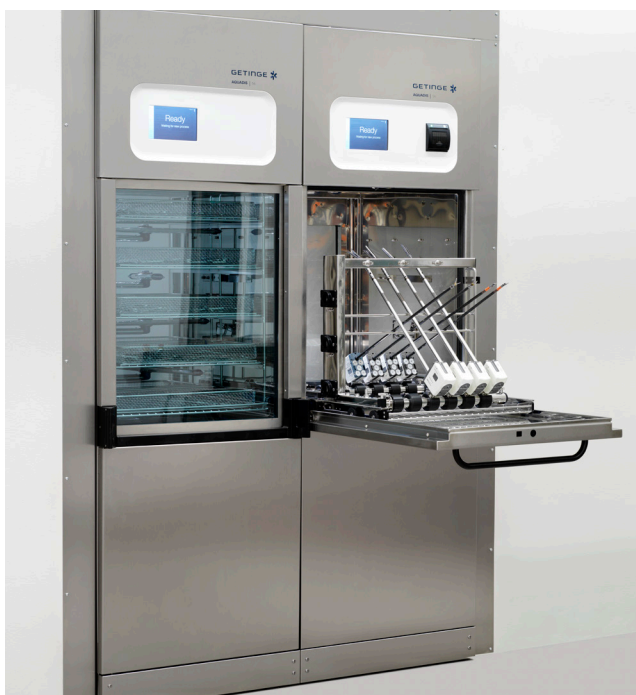
The manual folding door serves as a loading/unloading platform