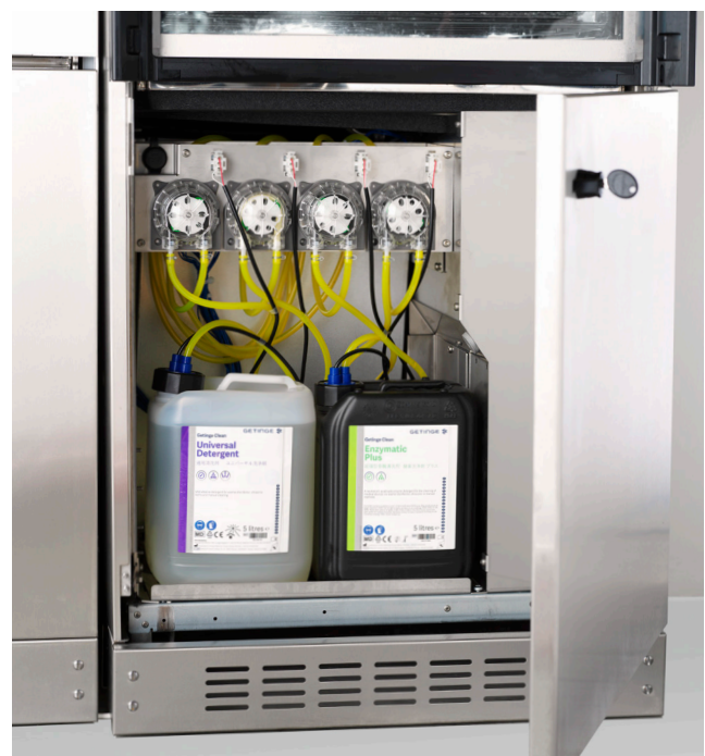
Built-in lockable compartment for cleaning chemistries