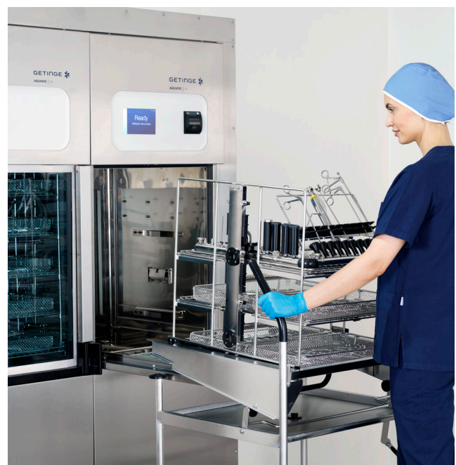
Loading/unloading trolley with 56M