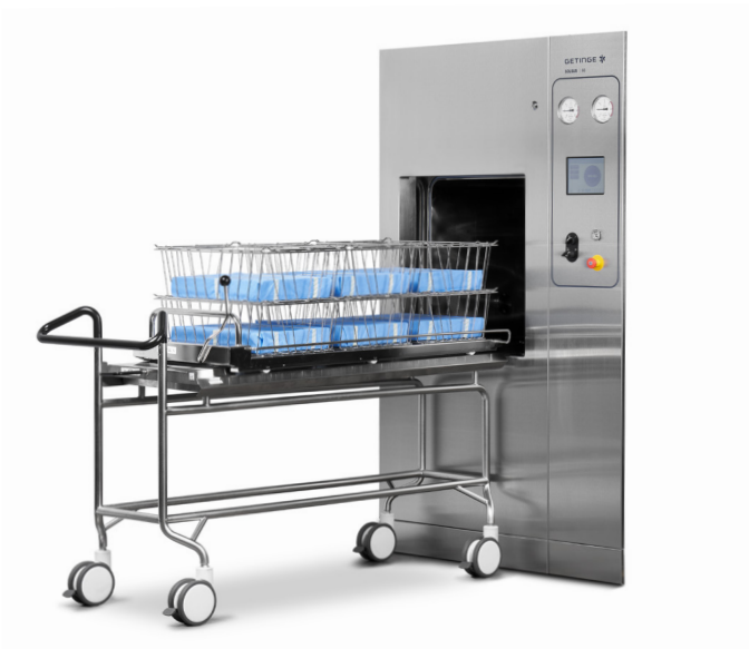
Manual loading/unloading of wire baskets, using Getinge Fixed Height Trolley (FHT).