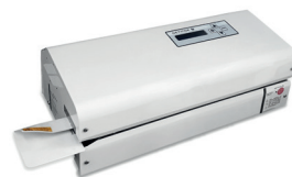
Getinge Pack Sealer