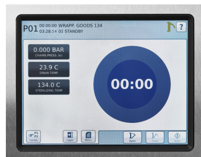
Intuitive user interface for a clear overview

Getinge has also developed a special pressure transducer to assure accurate reproducibility of the sterilization process in spite of ambient pressure fluctuations.