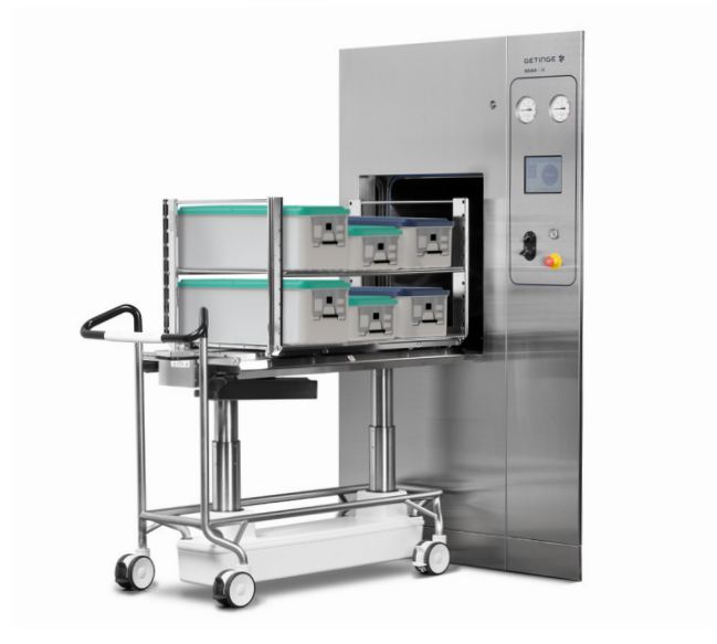
Manual loading/unloading of containers, using Getinge Smart Adjustable Height Trolley (AHT) with power drive function.